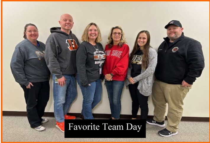
Favorite Team Day