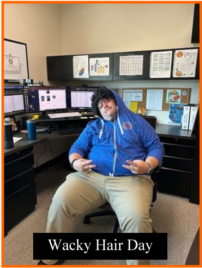
Wacky Hair Day