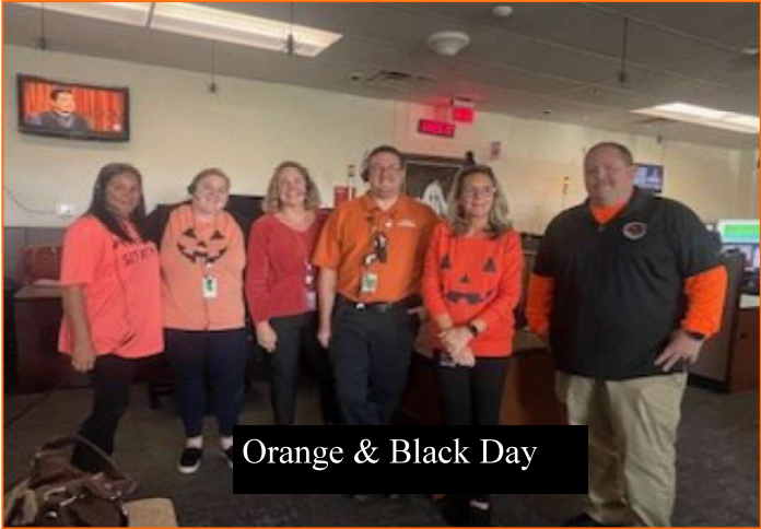
Orange & Black Day